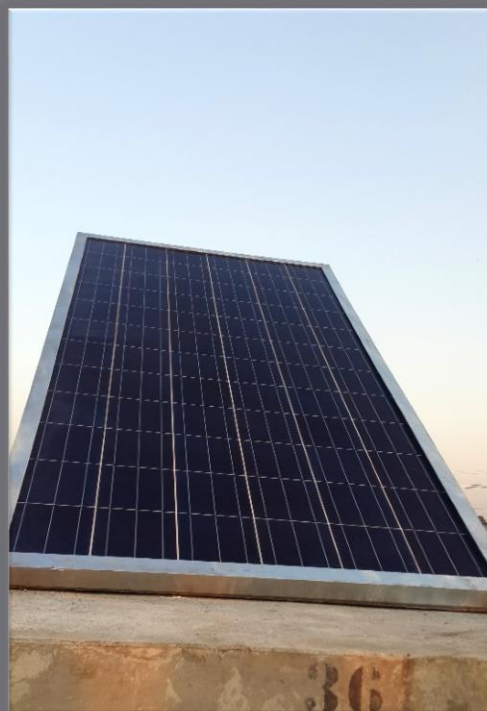
SMR Solar Panel

At Cathtect, We are all about innovation and new designs that meet the needs of clients. Cathtect's Solar Powered Rectifier is an innovative advancement in application of Cathodic Protection. This system is designed and developed to fundamentally protect pipelines using renewable energy, which decreases the amount of electricity required from the formal sector. This system saves electricity, money, resources and minimizes carbon footprint.